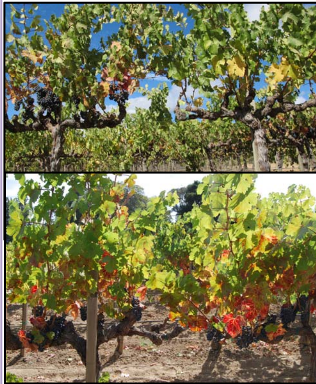
Cabernet Franc grapevines showing red blotch disease (top left and bottom) and harvested normal grapevine (top right), October 2012.

ETIOLOGY: The disease symptoms do not appear to be caused by nutritional deficiencies nor by stress, nor by bacteria, fungi and/or nematodes. A unique DNA virus was found