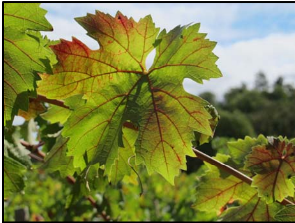
Red blotch and red veins on a leaf of Cabernet Franc grapevine.

DISEASE SYMPTOMS: The symptoms generally start appearing in late August through September as irregular blotches on leaf blades on basal portions of shoots. The secondary and tertiary veins turn partly or fully red. Occasionally, the reddening of leaf blade in the interveinal zones between secondary veins resembles those of leafroll diseases, but the leaf margins do not roll downward. Also, in leaf-roll affected red varieties the secondary and tertiary veins remain green. It is not known if the disease has any effect on fruit yield, and cause vine decline. The most significant impact of the disease appears to be on the Brix units of the berries. Brix of grapes in vines showing red blotch symptoms has been found to be 4 to 5 units lower than those with green canopies and this difference is higher than those normally seen in leafroll-affected grapevines.